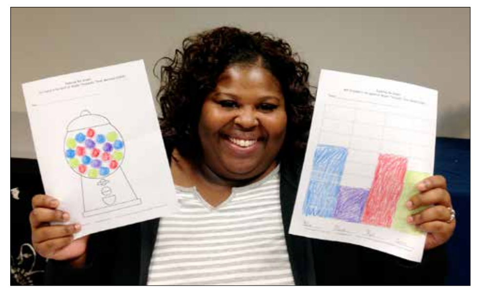
A CREATIVE CURRICULUM: Using artwork and creative graphs helps make mathematics more colorful for both students and teachers.

Teachers then compared, contrasted and interpreted their bar graphs. Similarly, teachers made their own compositions in the spirit of Mondrian's primary-colored art and then created the number sentence that