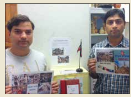
FROM ONE COMMUNITY TO ANOTHER: Rice Nepalese students and scholars contributed to a book with thoughts of support and love for Nepal.

Partnering with Rice's Office of International Students and Scholars (OISS), the Nepalese students and scholars created a book so that the Rice community could write thoughts of support and love for the people of Nepal.