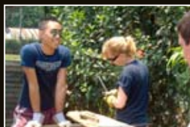
PAGE 2: Rice students contribute to communities in Guatemala.

In addition to running after-school tutorials at Ortiz, SEEK began working with an undergraduate