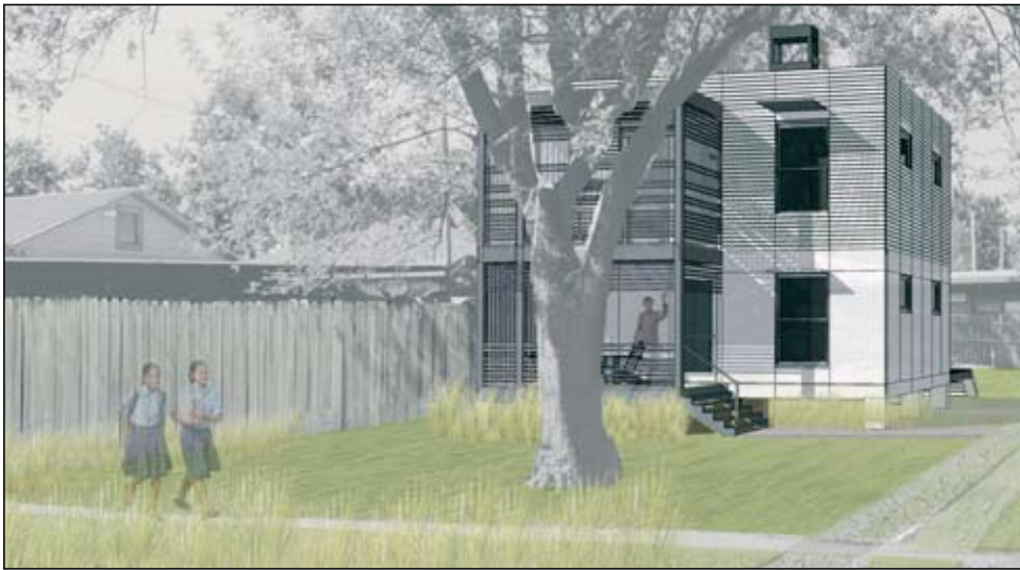
DESIGNING OPPORTUNITY: A rendering of the winning design of the 99K House competition.

This year, the RDA celebrates 36 years as a nonprofit, public education outreach program