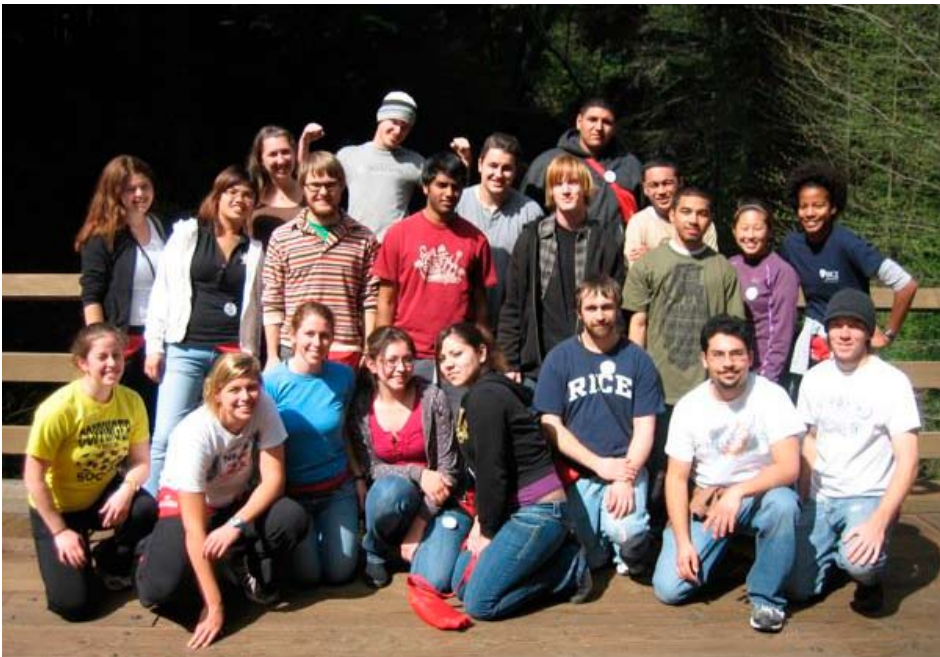
A BREAK FOR THE BETTER: 2008 Alternative Spring Break participants