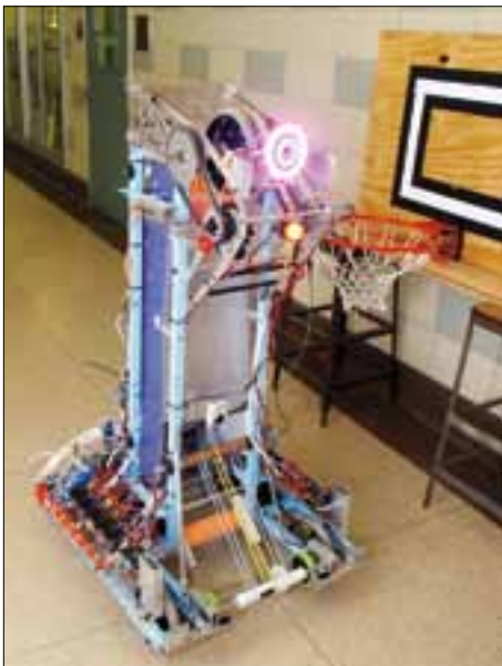
A WINNING DESIGN: A robot that can shoot hoops.

high schools from across Texas and won the regional event. Over the last four years, the team, known as the Discobots, has won the Houston Regional competition.