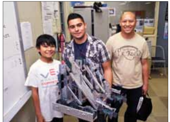
BUILDING A CULTURE OF EXCITEMENT: Rice students work with local high school students to build a robot.