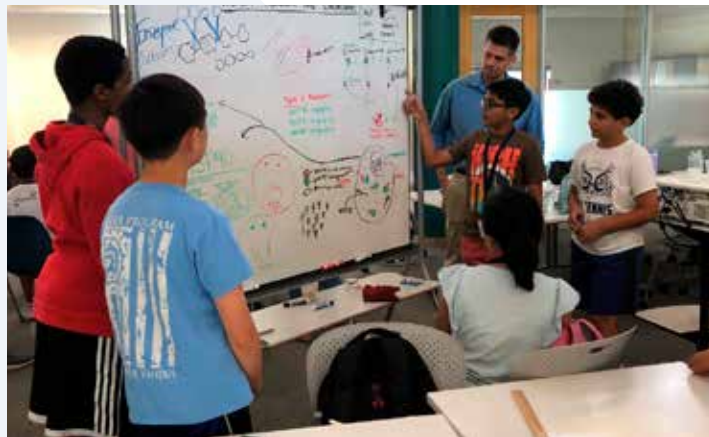
GETTING ON BOARD: Students practice their presentation on protein mutations.

The official data from the graduate student scientists and engineers who shared their Saturday with these youths are still pending, but their