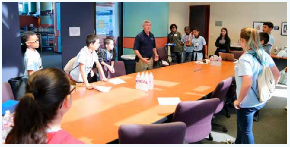
CULTIVATING STEM STUDENTS: Middle school students learn about opportunities that STEM careers have to offer.

DISCOVER ENGINEERS WEEK FEBRUARY 19-25, 2017