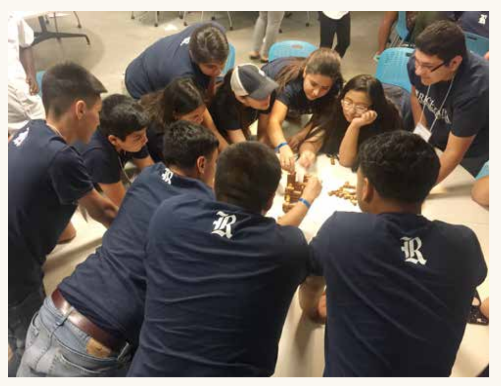
BUILDING A CAREER: High school students at the Tapia Camp in Physics learn what it takes to become a scientist.

communicate not only what they know, but how they arrived at the conclusions. The goal is to help them help someone who doesn't have their background understand these concepts."