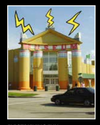
ELECTRIFYING FUN: Rice University students contribute to the "Shocks and Jolts" exhibition at the Children's